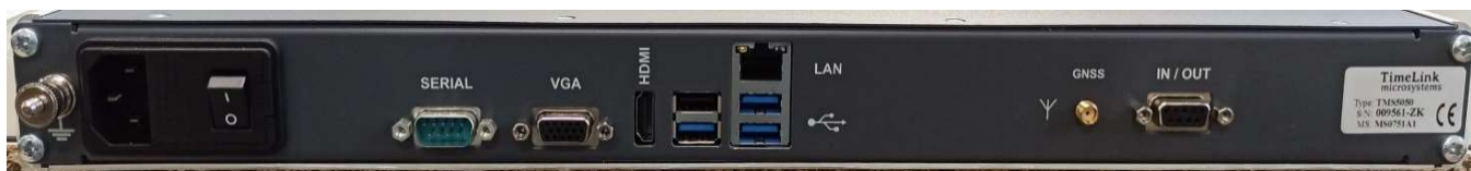
TMS5050-STD – Standard Back panel (NTP only)